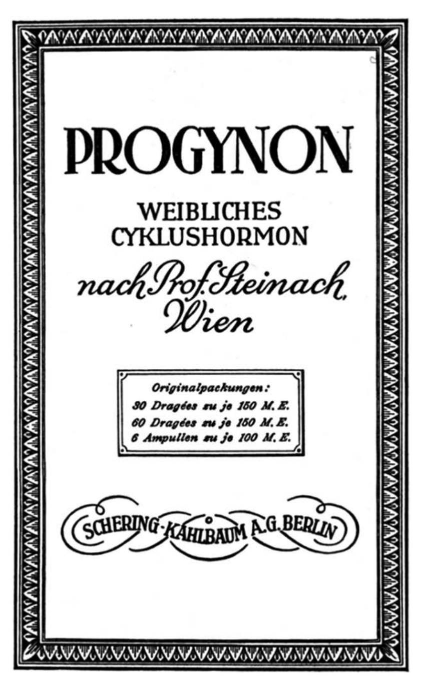
Figure 2. The ad used for the launch of Progynon by Schering in 1928. Reproduced with permission of Bayer AG.

times, that he clearly deserved to be awarded the prize and that he barely missed it in 1921 because two members of the Nobel Committee expressed skepticism concerning the role of the interstitial cells and the clinical applications. Liljestrand outlined Steinach's main findings. Thus, Steinach had managed to "malemake" females and "femalemake" males and "numerous replications have shown that these observations are correct." He further wrote, "it appears obvious to me" that the "lability" of sex and the existence of " bipotentiality . . . is a fact of fundamental importance " (italics added). In fact, Liljestrand consid-