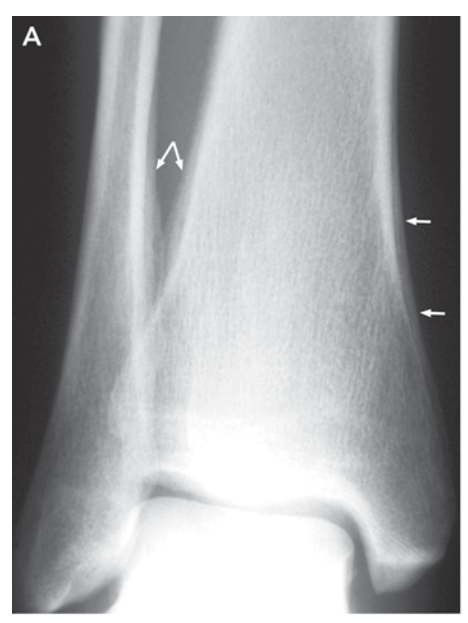
A: Ankle x-ray showing periosteal reaction and new bone formation along the ends of the tibia and fibula (arrows).

B: Bone scan showing symmetrical increased tracer uptake at both the proximal and distal ends of long bones, hands and feet. Disease activity is more prominent in the lower limbs. Lung uptake is probably the result of metastatic calcification, which can be predominantly apical<sup>1</sup> and not visible on x-ray or conventional computed tomography.<sup>2</sup>